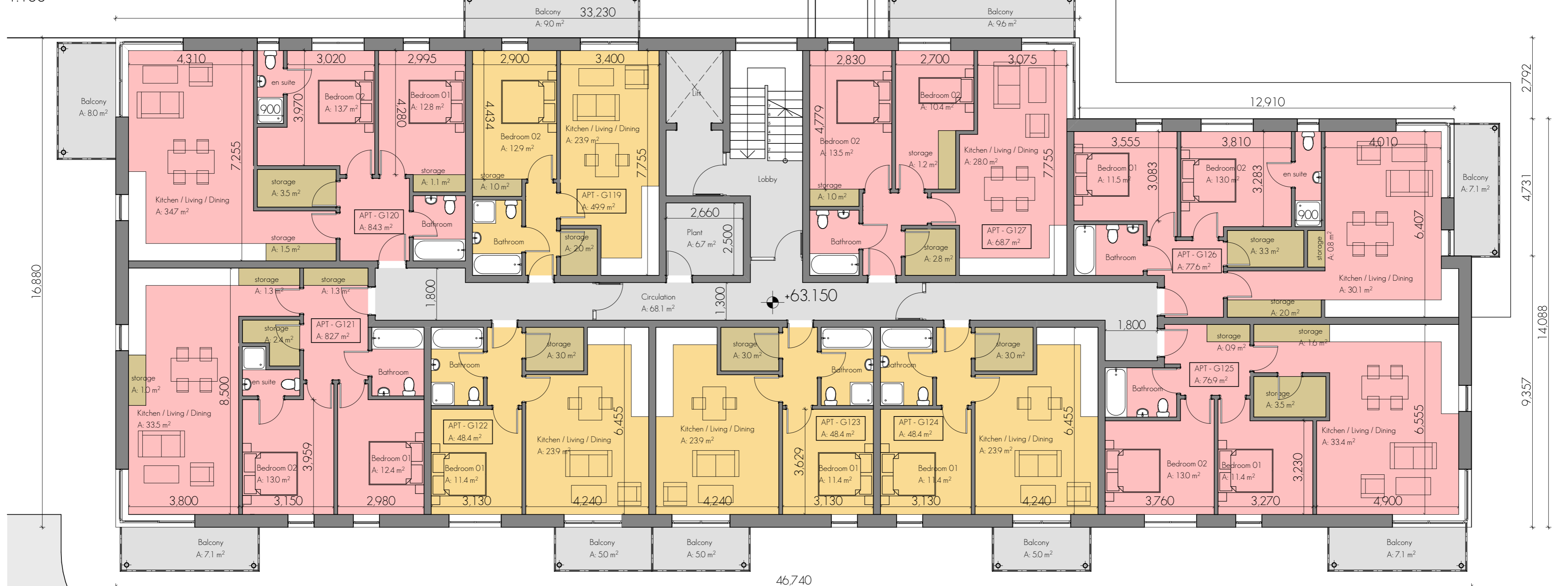
FIRST FLOOR PLAN - BLOCK D THIS IS THE TYPICAL UPPER FLOOR FOR THE 1ST, 2ND & 3RD FLOOR - FLOOR LEVEL - 1ST 63.150, 2ND 66.075, 3RD 69.000