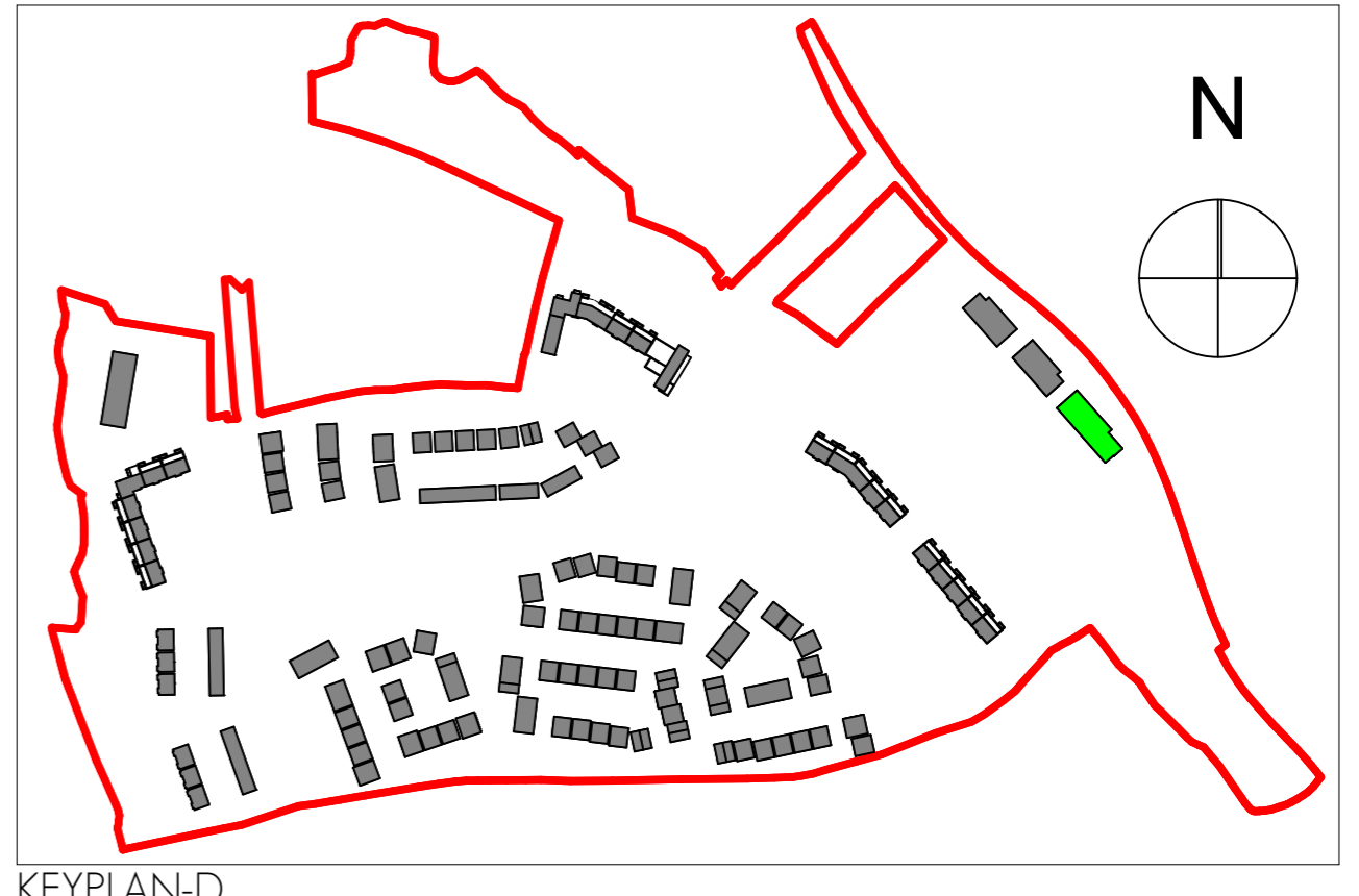
KEY PLAN - D