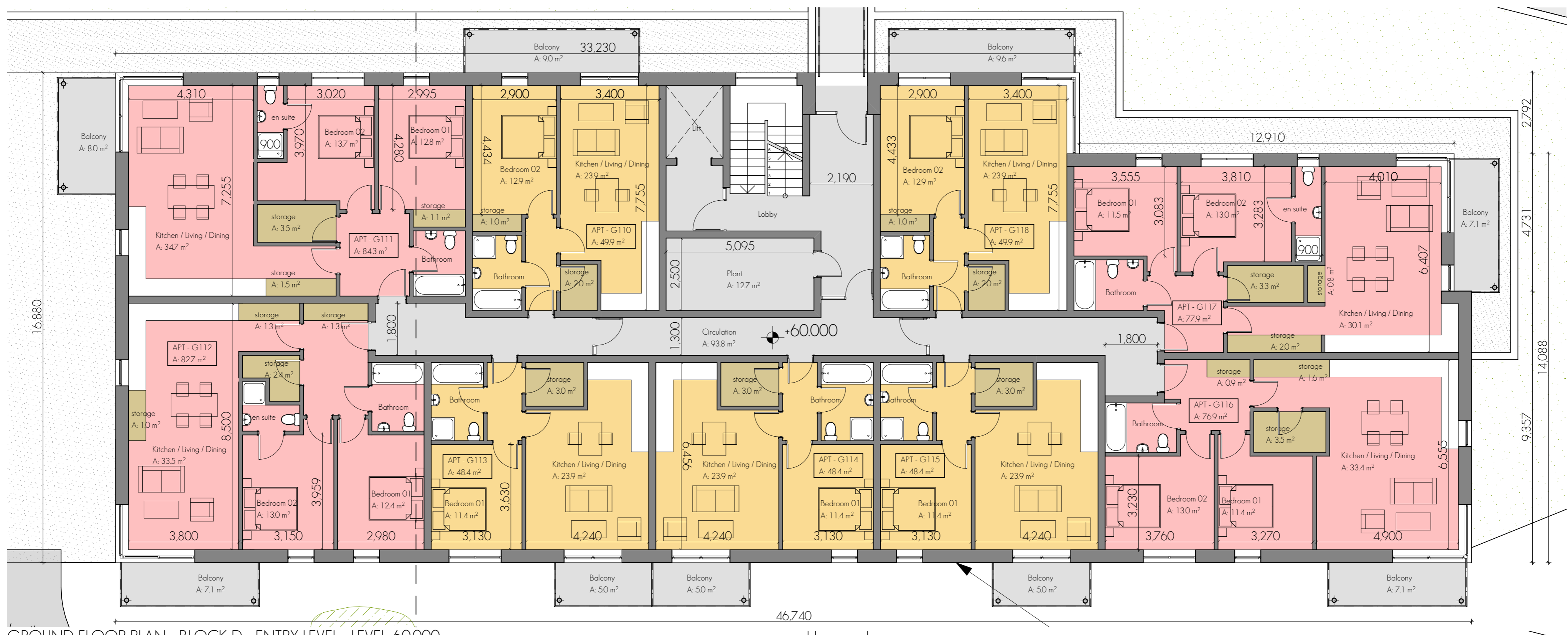
GROUND FLOOR PLAN - BLOCK D - ENTRY LEVEL - LEVEL 60,000